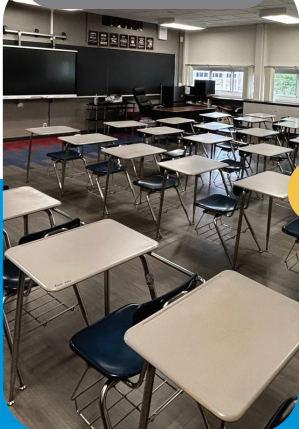
Typical WWCS Classroom Furniture