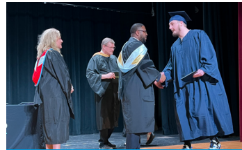
Wayne-Westland Innovative Academy Graduation