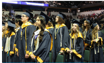
Wayne Memorial High School Graduation

Some have enlisted in the Army, Navy, Air Force, and Marines. We are proud to have them serve our country. Our graduates have also earned certifications in skilled trades at our career-technical center. They will enter the workforce with the necessary skills to earn competitive salaries.