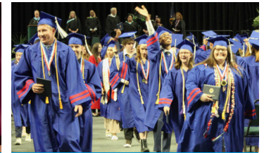
John Glenn High School Graduation